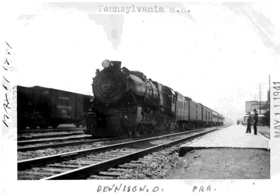
K4s #3838 eastbound with Train Number 6. May 1, 1941.